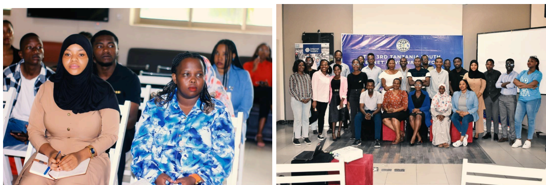
Figure 2: Youth IGF Tanzania 2024

The 3rd Youth Internet Governance Forum (Youth IGF) Tanzania was successfully held on 25th October 2024 at Buni Hub. The event brought together youth, industry experts, and stakeholders to discuss key internet governance issues under the theme: "Empowering a Safer, Inclusive, and Innovative Digital Future.". The forum served as a platform for young people to exchange ideas, address digital challenges, and propose solutions for a more inclusive and safer digital environment. With 117 registrations and 62 attendees, this year's forum marked a significant step in youth engagement in Internet governance.