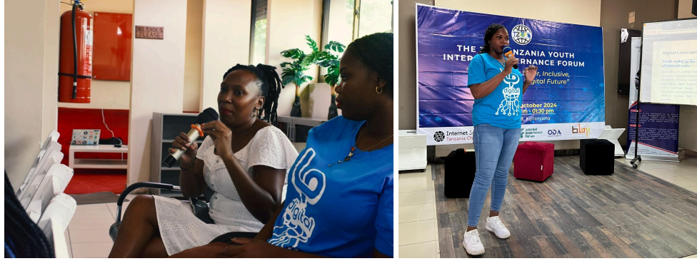
Figure 7: Presentation from the LaunchPad Tanzania