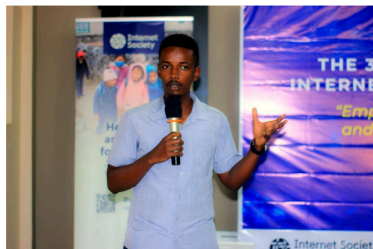
Figure 8: Buni Hub giving closing remarks

Buni Hub concluded the event with remarks emphasizing the importance of youth participation in Internet governance and the need for continued engagement. They also highlighted some of the programs that young people can benefit with through the Hub.