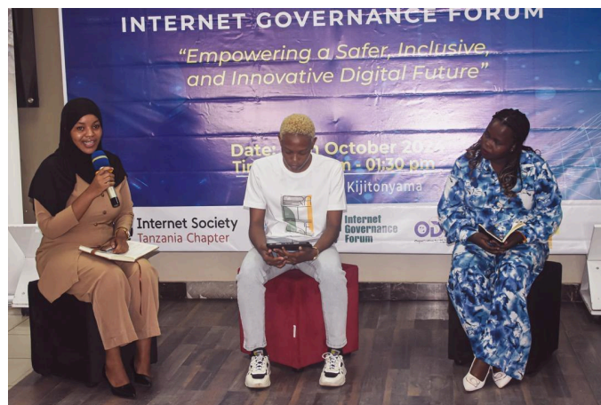
Figure 6: Session on Improving digital governance for the Internet we want