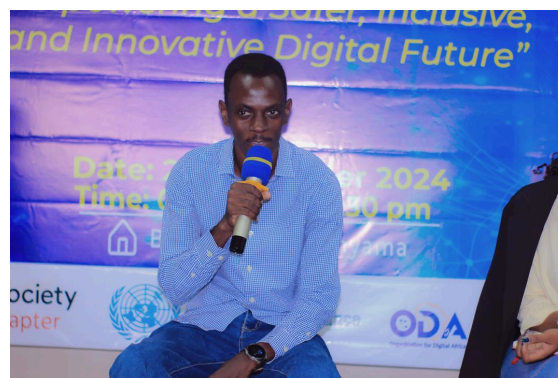
Figure 5: Session on Harnessing Innovation and Balancing risks in digital space