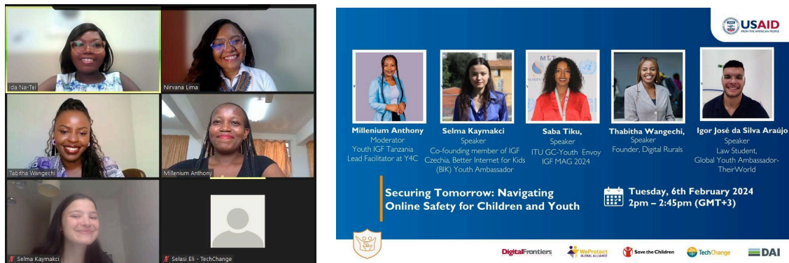
Figure 1: Moments from the Symposium on Protecting Children and Youth from Digital Harm